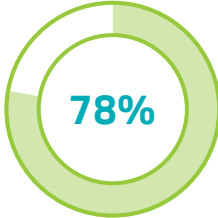
Infection control and prevention staff